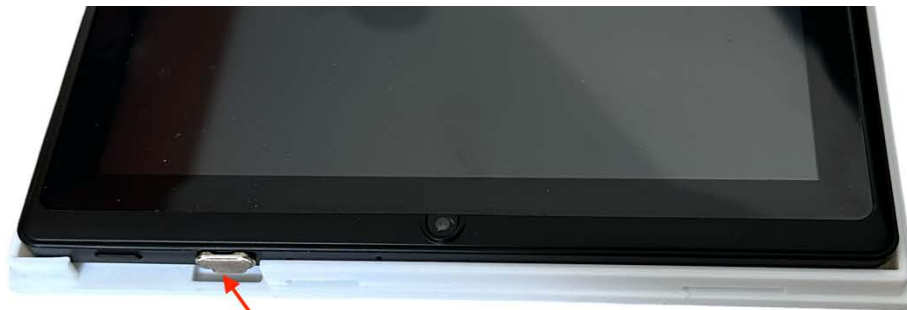
Slim USB-C connector in place. Will be hidden once cover is on.